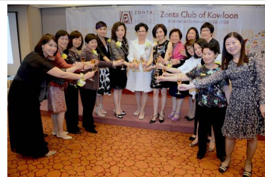
Zonta Kowloon Board & Committee Chairs